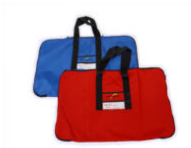
Transport Bag 45,00 EUR